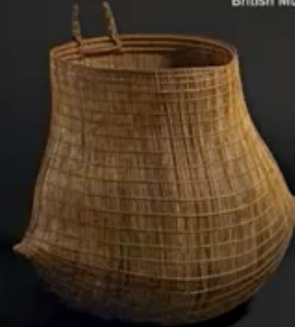
Cane bicornual basket from Rockingham Bay, Queensland British Museum Oc,+1185

and I always tell people I've been taught by master craftsmen