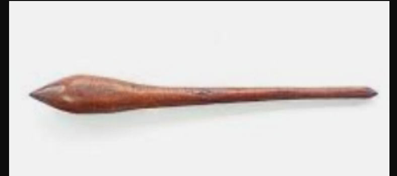
Used by aboriginal people