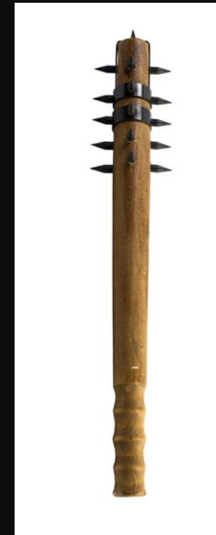
Used in the medieval times